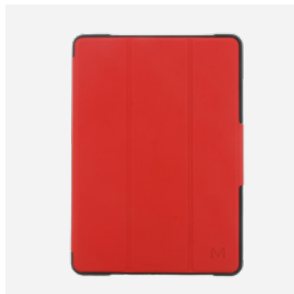
RED Ref. 062017