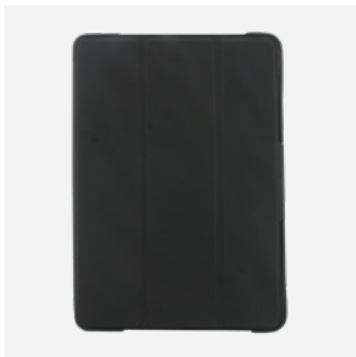
BLACK Ref. 062016