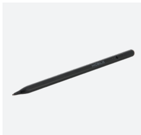
BLUETOOTH STYLUS Ref. 001090