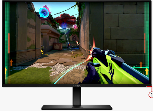
1. Power LED