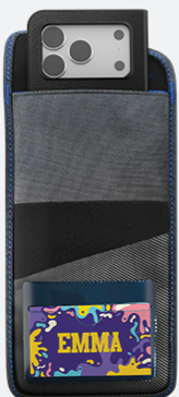
ShieldBloc Pouch with RF blocking

MAXCases Shield Phone Pouches protect and store cellphones to help educators create more focused classrooms. Conveniently store them during instructional time with the Shield Pouch Organizer. Designed for versatility and perfect fit, the Velcro surface securely holds sixteen Shield Pouches and can be hung vertically from the integrated grommets or folded to form a sturdy two-sided, free-standing holder. Folds for compact storage or transportation.