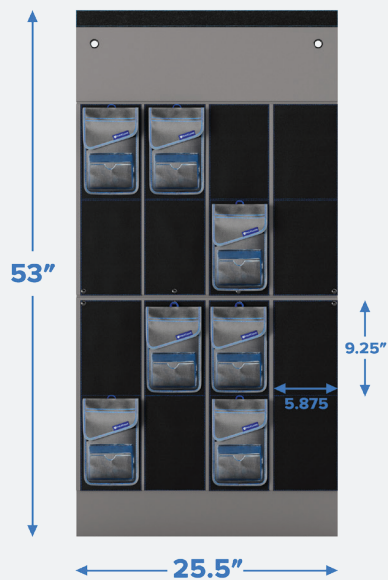
Hanging dimensions: 25.5" W x 53" H

SHIELD PHONE POUCH ORGANIZER, 16 COUNT CAPACITY WALL OR DOOR MOUNTABLE, FOLDABLE FOR TABLETOP USE AND STORAGE