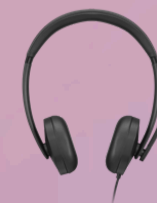
Lenovo Wired VoIP Headset 5000 4XD1R88995

Please click here to view the full list of accessories.