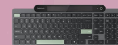
Lenovo Self-Charging Bluetooth Keyboard-French Canadian 058 4Y41R69498