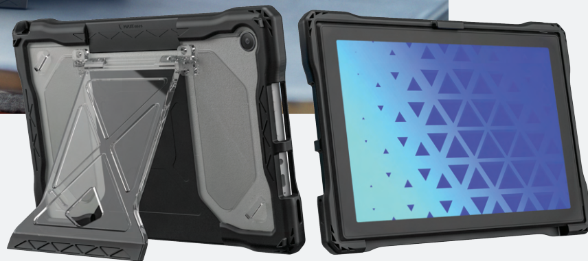
Custom-fit for the Asus CM30 Tablet 10.5"

The Shield Extreme-X2 provides custom-fit protection for the Asus CM30 tablet, plus customizable viewing positions. The rugged design features dual layers of tough TPU for outstanding impact and drop protection, combining a cushioning inner layer with an oil- and dirt-resistant outer layer. The virtually break-proof FlexStand kickstand provides unlimited, stable positioning options thanks to the easy-sliding friction hinge. The perfect-fit design delivers easy access to all ports, openings, and buttons. Durable corner anchors make it easy to add an (optional) hand strap, shoulder strap or any clip-on accessory.