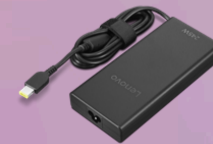
Lenovo 245W AC Adapter (Slim tip)-UK GX21T87706

Please click here to view the full list of accessories.