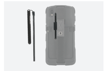
STYLUS Ref. 001080