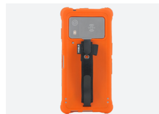
ZEBRA EM45 Ref. 052069