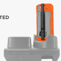
Compatible with hand strap