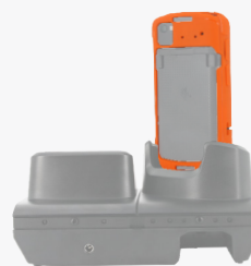
Compatible without hand strap

Compatible with ZEBRA extended battery: BTRY-TC2L-3XMAXX-01