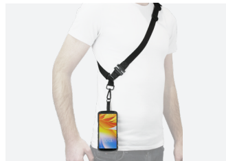
SHOULDER STRAP Ref. 001084