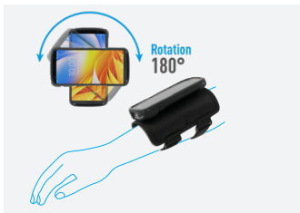
ARMBAND SUPPORT Ref. 030004