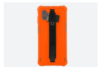
SAMSUNG XCOVER 7 PRO Ref. 052066