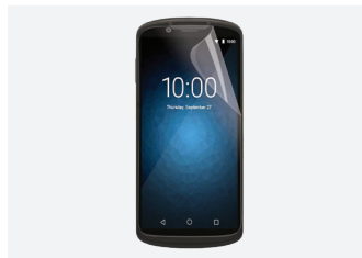
PROTECTIVE SCREEN Ref. 036267