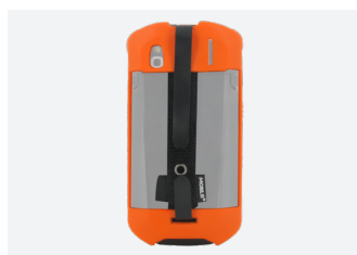
ZEBRA TC51 - TC52 Ref. 052067