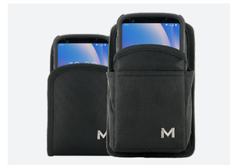
HOLSTERS Ref. 031009 / 031012