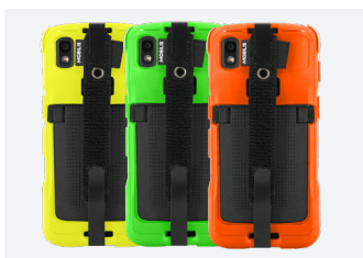
ZEBRA TC22 - TC27 Refs. 052062 / 052063 / 052064