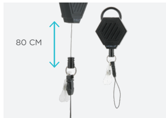
RETRACTABLE HOOK Ref. 001392