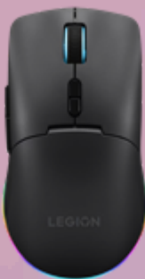
Lenovo Legion M220 Wireless RGB Gaming Mouse GY51U28359

Please click here to view the full list of accessories.