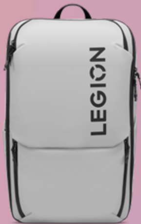
Lenovo Legion 17" Gaming Backpack GB800 (Light Gray) GX41U39300

Lenovo may not offer the products, services or features discussed in this document in all regions. Lenovo may withdraw an offering at any time. Consult your local representative for information on offerings available in your area. Lenovo reserves the right to change specifications or other product information without notice. Lenovo is not responsible for photographic or typographical errors. Lenovo provides this publication "as is" without warranty of any kind, either express or implied, including the implied warranties of merchantability or fitness for a particular purpose.