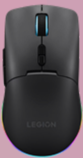
Lenovo Legion M220 Wireless RGB Gaming Mouse GY51U28359

Lenovo may not offer the products, services or features discussed in this document in all regions. Lenovo may withdraw an offering at any time. Information is subject to change without notice. Consult your local representative for information on offerings available in your area. Lenovo reserves the right to change specifications or other product information without notice. Lenovo is not responsible for photographic or typographical errors. Lenovo provides this publication "as is" without warranty of any kind, either express or implied, including the implied warranties of merchantability or fitness for a particular purpose.