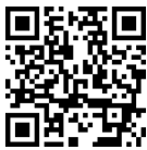
UX10 3D demo