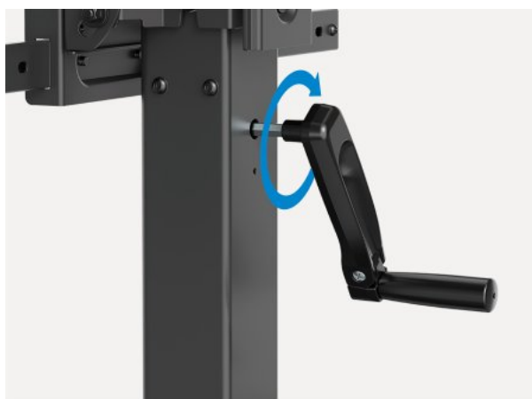
With convenient crank handle Smooth and effortless TV height adjustment