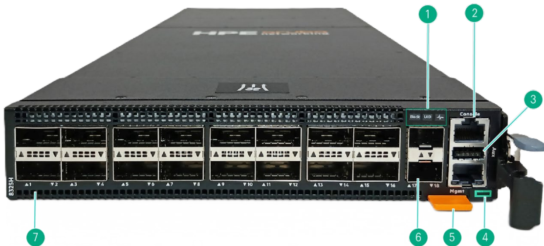
HPE Storage DCN 16p QSFP28 100GbE Power to Connector Half Width Sw H-series SN8325H (Front View)