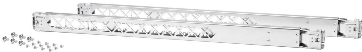
HPE Aruba Networking 1U Universal 4-post Rack Mount Kit (R9F57A)