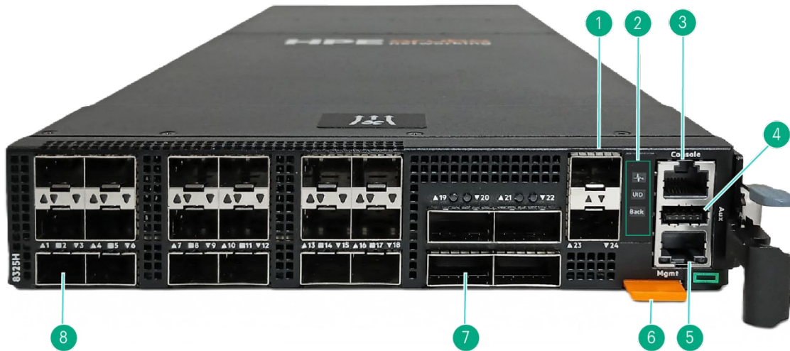
HPE Storage DCN 18p SFP28 25GbE 4p QSFP28 100GbE Power to Connector Half Width Sw H-series SN8325H (Front View)