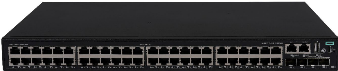
HPE Networking Comware Sw 48G 4P 5150EI (S5T50A)