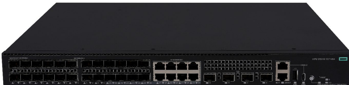
HPE Networking Comware Sw 24F 8G 4P 5150EI (S5T48A)

Network visibility, management, and operation tools for this series include standard CLI and the Smart Management Center (SmartMC), embedded and ready to use at no additional cost. The series integrates with HPE Aruba Networking IMC, delivering a centralized point of control for your entire network