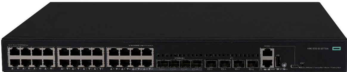
HPE Networking Comware Sw 24G PoE+ 4F 4P 5150EI (S5T51A)