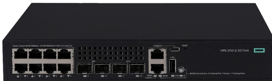
HPE Networking Comware Sw 8G PoE+ 2F 2P 5150EI (S5T54A)