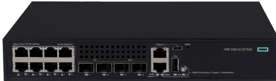
HPE Networking Comware Sw 8G 2F 2P 5150EI (S5T53A)