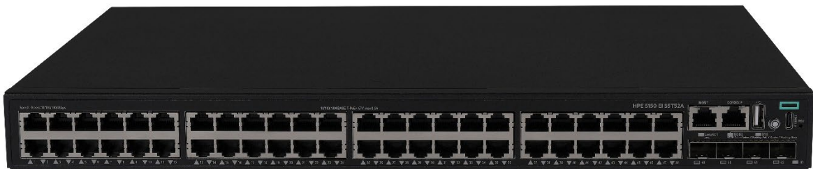
HPE Networking Comware Sw 48G PoE+ 4P 5150EI (S5T52A)