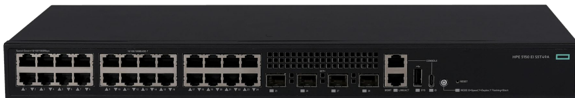
HPE Networking Comware Sw 24G 4P 5150EI (S5T49A)