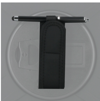
Intregated on the hand strap Stylus not icluded