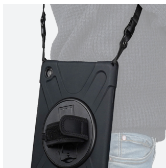
Shoulder strap included