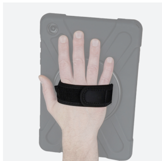
Portrait mode (Non contractual photo)