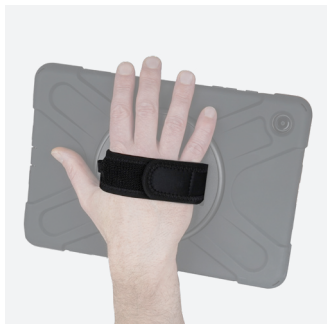
Landscape mode (Non contractual photo)