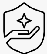
3-year pickup and return UM963E