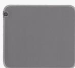
HP 100 Sanitizable Mouse Pad 8X594AA