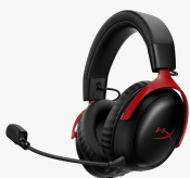
HyperX Cloud III S Wireless - Gaming Headset (Black- Red) A59Z0AA