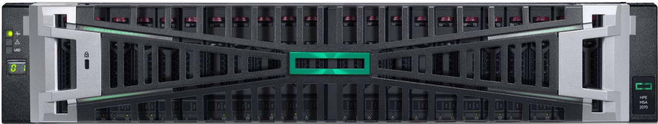
HPE MSA Gen7 Storage – Front View