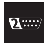
2 COM Ports