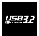
USB 3.2 Gen 2 Type A