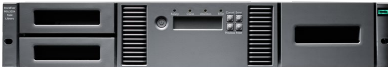
HPE Storage MSL2024 Tape Library

Quickly and simply manage the tape media both in and out of the library with the standard bar code reader, configurable mail slots, and removable magazines. If a tape were lost or stolen, protect important business data from unauthorized access with data encryption options. MSL investment protection and uncertain data growth are easily managed within the MSL library portfolio. Quickly increase capacity and/or performance with tool-free drive upgrades in the MSL2024 Tape Library or move tape drive kits to the MSL3040 or MSL6480 for library scalability and additional enterprise class features. Proactively receive detailed information about your MSL Tape Automation with HPE StoreEver TapeAssure Advanced, a licensed feature of CVTL. Information about the library, drives, and media are all monitored for utilization, operational performance, and life and health information. Prevent problems before they occur by proactively receiving notification if any library, drive or tape media parameters fall below Hewlett Packard Enterprise recommended standards.