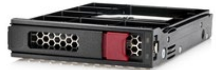
Low Profile Converter (LPC)