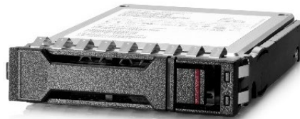
Basic Carrier (BC)