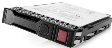
Smart Carrier (SC)