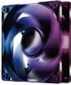
Ultra-quiet HDB fan

A hydrodynamic bearing fan delivers long-lasting quiet and effective cooling.