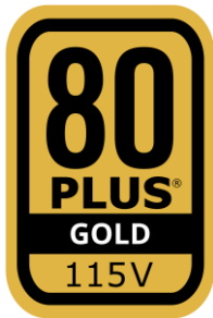
80 Plus Gold efficiency certification

A 50°C operating temperature allows for pushing your machine to the limits.