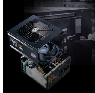
High temperature resilience

A hydrodynamic bearing fan delivers long-lasting quiet and effective cooling.