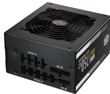
Fully modular cabling

Certified to achieve more than 90% efficiency at typical loads.