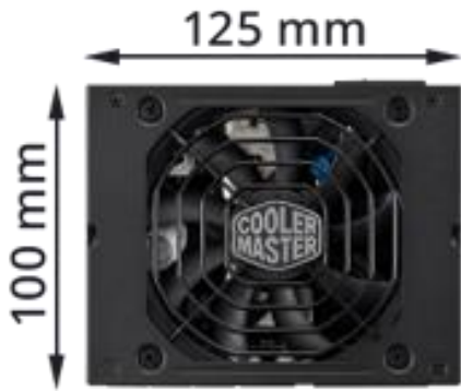
Compact SFX form factor

The ultra-compact dimensions of this SFX unit make it the perfect fit for a mini-ITX build.