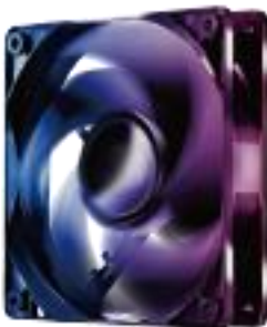
Quiet FDB fan

An included bracket ensures compatibility with both ITX and ATX cases.