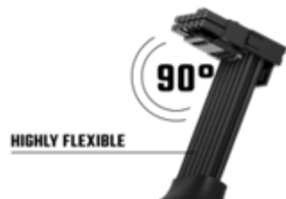
A durable 12V-2x6 cable

A fluid dynamic bearing fan delivers long-lasting quiet and effective cooling.