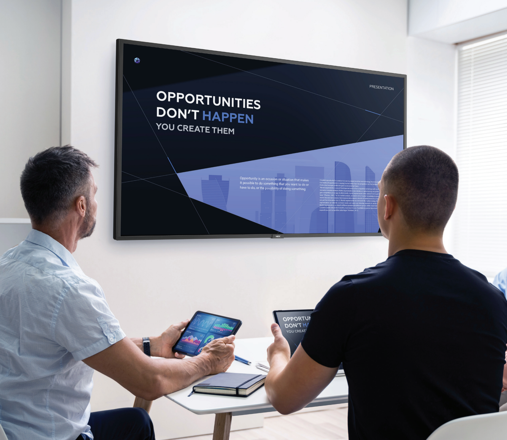
Professional Displays Ideal for Digital Signage Applications

NEC MultiSync® M Series Large Format Displays