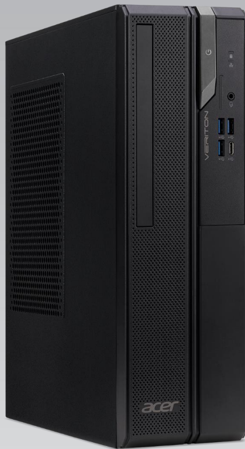
Veriton 2000 Compact Tower