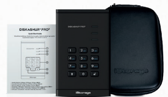
diskAshur PRO 3 portable HDD/SSD, Carry Case and Quick Start Guide