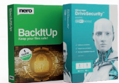
Free 1 year license of Nero BackItUp and iStorage DriveSecurity