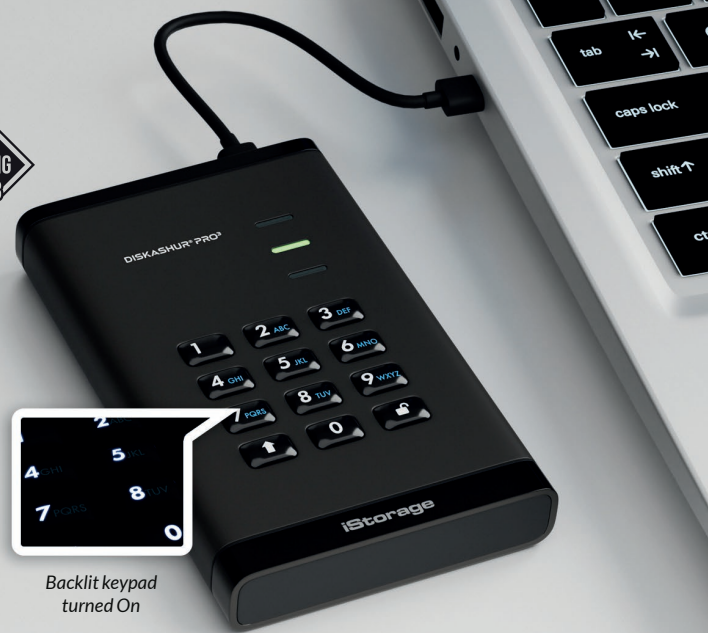
Backlit keypad turned On

The TAA-compliant drive is available in capacities of up to 16TB and redefines the standard for securing data with ease and confidence.