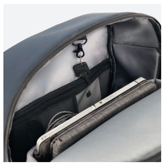
With organizer, mesh pocket and keyring