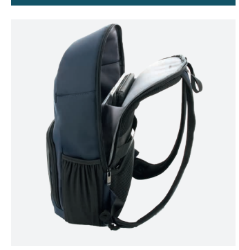
For all PC up to 16"