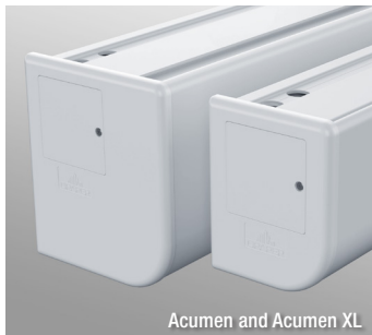
Acumen and Acumen XL