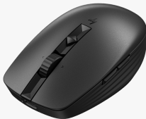
HP 710 Rechargeable Silent Mouse 6E6F2AA