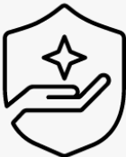
3-year pickup and return UM963E