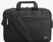
HP Professional 14.1-inch Laptop Bag 500S8AA