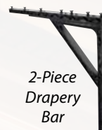
2-Piece Drapery Bar