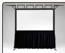
FocalPoint with Dress Kit Skirt and Hardware