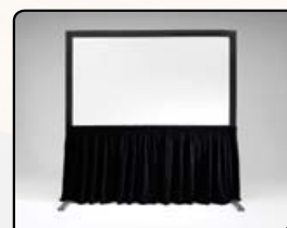
FocalPoint with Dress Kit Skirt