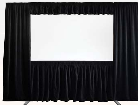
Complete Dress Kit

The skirt utilizes DuraLoops™ on each end, in addition to magnetic connectors built into the skirt for surprisingly fast and easy attachment.