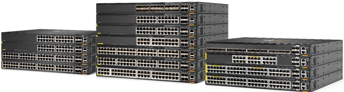
HPE Aruba Networking CX 6300 Switch Series

Dynamic Segmentation extends foundational wireless role-based policy capability to wired switches. What this means is that the same security, user experience and simplified IT management can be enjoyed throughout the network. Regardless of how users and IoT devices connect, consistent policies are enforced across wired and wireless networks, keeping traffic secure and separate.