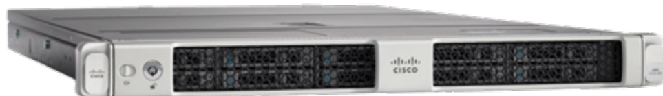
Figure 1. Cisco Secure Network Server

Figure 1 shows the Cisco Secure Network Server.