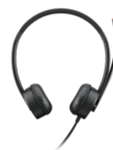
Lenovo Essential Stereo Analog Headset