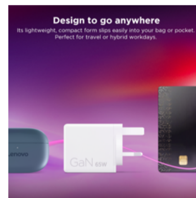
Lenovo Dual USB-C 65W GaN Charger