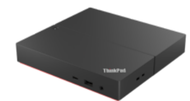
ThinkPad Universal USB-C Smart Dock - ThinkSmart Edition