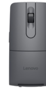
ThinkPad Bluetooth Presenter Mouse (Aura Edition)