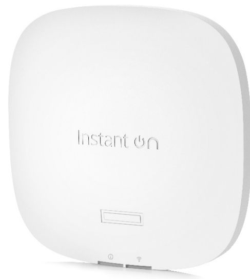
HPE Networking Instant On Access Points AP22

The HPE Networking Instant On Access Points AP22 is our core Wi-Fi 6 access point that gives you the bang for your buck. It hosts a 2x2 antenna array supporting 2 spatial streams with a max aggregate data rate of 1.7 Gbps. The AP22 is ideal for corporate offices, healthcare facilities and hybrid classrooms that require EN certification, or hybrid classrooms. This access point has the same security and reliability as the AP25 at a more attractive price.