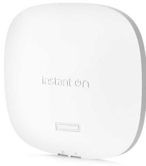
HPE Networking Instant On Access Points AP25

The HPE Networking Instant On Access Points AP25 is our top performer, with a 4x4 antenna array that supports 4 spatial streams to provide coverage and speed in device-dense networks, and is best if used in common areas where 100 or more of your customers can gather. The AP25 2.5GbE uplink port enables more network bandwidth to support the wireless maximum 5.3Gbps throughput for connected clients compared to traditional 1GbE uplink in other Wi-Fi 6 access points.