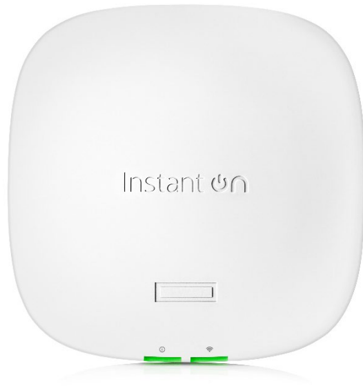
HPE Networking Instant On Access Points AP21

The HPE Networking Instant On Wi-Fi 6 family has the right access point to fit your business needs. From cost-effective single room streaming to conference room collaboration to exhibition hall environments, our wireless solutions make your network accessible and efficient.