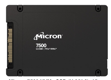
Micron 7500 NVMe SSD (U.3/U.2), 15mm

The 7500 SSD is a versatile solution that delivers the performance required by complex and critical business workloads.