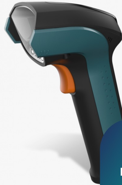
NVH220 Lophius Bluetooth Handheld Scanners