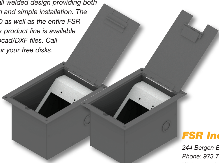
FL-1300 Blk (Large door open)