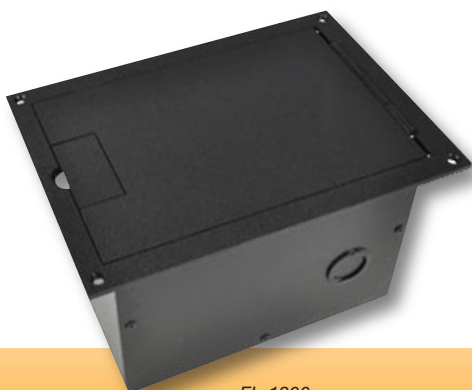
FL-1300 with Hinged Door in Black Sandtex