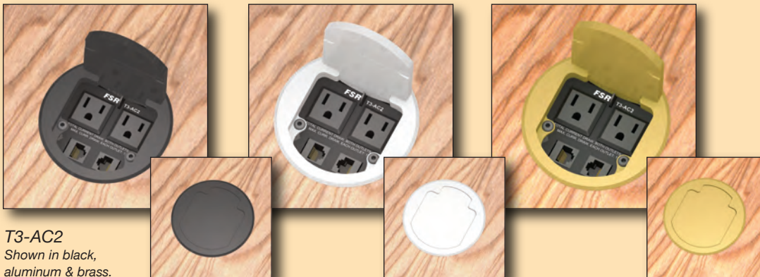
T3-AC2 Shown in black, aluminum & brass.