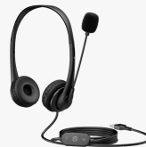
HP Stereo USB Headset G2 428H5AA