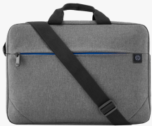
HP Prelude 15.6-inch Laptop Bag 2Z8P4AA