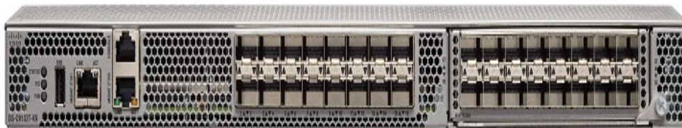
HPE Storage Fibre Channel Switch C-series SN6610C

The HPE Storage Fibre Channel Switch C-series SN6610C can be provisioned, managed, monitored, and troubleshot using Nexus Dashboard Fabric Controller (NDFC) (previously called Data Center Network Manager (DCNM)), which currently manages the entire suite of Cisco data center products. Powered by C-series MDS 9000 NX-OS Software, it includes storage networking features and functions and is compatible with C-series SN8500C/SN8700C (MDS 9700) Series Multilayer Directors, C-series SN6620C (MDS 9148T) Multilayer Fabric Switches, C-series SN6630C (MDS 9396T) Multilayer Fabric Switches, C-series SN6710C (MDS 9124V) Multilayer Fabric Switches, C-series SN6720C (MDS 9148V) Multilayer Fabric Switches, C-series SN6730C (MDS 9396V) Multilayer Fabric Switches, and C-series SN6640C (MDS 9220i) Multi-service Fabric Switches providing transparent, end-to-end service delivery in core-edge deployments.