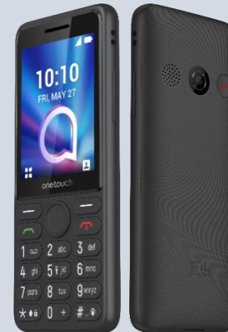
Dark Night Grey

Torch Light, Bluetooth: 5.0 USB data transfer, M3 & T3 3.5mm Audio Jack, Audio (Single Speaker + PA)