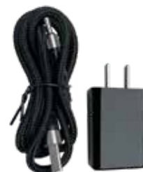
Cable & power adapter

* Specifications Are Subject to Change Without Notice.