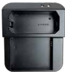
Single docking station (Charge at the same time Bodycam + Battery)