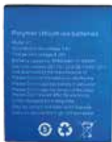
Battery the 3.8V (3050mAh / 11 hours)