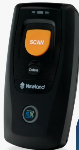
BS80 Piranha II 1D Handheld Scanners