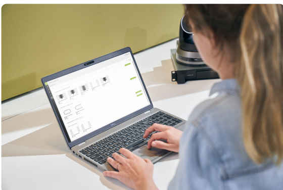
EASILY SWITCH BETWEEN SEVERAL ROOM LAYOUTS SERVING MULTIPURPOSE SPACES