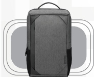
Lenovo 15.6" Laptop Urban Backpack B530