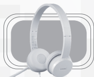
Lenovo 110 USB Stereo Headset