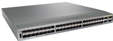
Figure 4. Cisco Nexus N2248PQ

The Cisco Nexus 2232PP 1 and 10 Gigabit Ethernet fabric extender (Figure 5) is an excellent platform for migration from 1 Gigabit Ethernet to 10 Gigabit Ethernet and unified fabric environments. It supports FCoE and DCB.