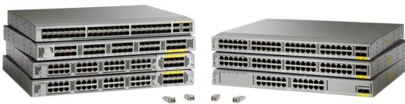
Figure 2. Cisco Nexus 2000 Series Fabric Extenders from Bottom Right to Top Left: Cisco Nexus 2224TP GE, 2248TP GE, 2248TP-E GE, 2232TM 10GE, 2232TM-E 10GE, 2232PP 10GE, and 2248PQ 10GE; Cost-Effective Fabric Extender Transceivers for Cisco Nexus 2000 Series and Cisco Nexus Parent Switch Interconnect Are in Front of the Fabric Extenders

The Cisco Nexus 2000 Series provides two types of ports: ports for end-host attachment (host interfaces) and uplink ports (fabric interfaces). Fabric interfaces, differentiated with a yellow color, are for connectivity to the upstream parent Cisco Nexus switch.