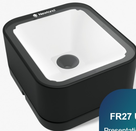
FR27 Urchin Presentation Scanners