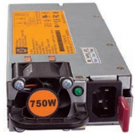
HP 750 W CS HE Power Supply