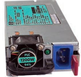
HP 1200 W CS Platinum Power Supply