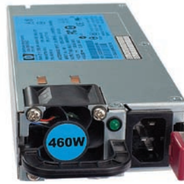
HP 460 W CS HE Power Supply