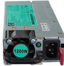
HP 1200 W CS HE Power Supply